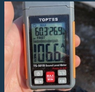
Before Liner 106.6 DB