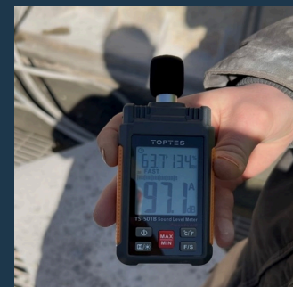
After Liner 97.1 DB