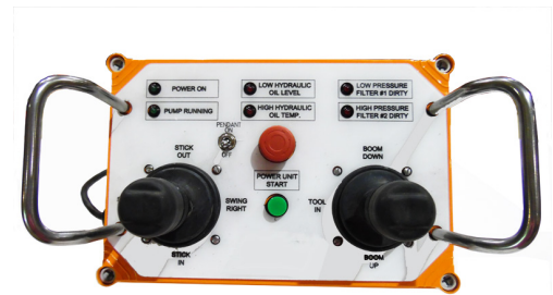
Deluxe Electrohydraulic joystick remote control