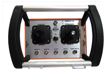
Radio remote control

Standard controls package includes manual control valve console and electrohydraulic joystick controls.