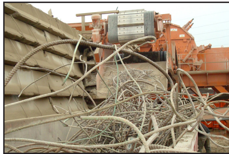
Available in-line electro-magnet on side-discharge conveyor.