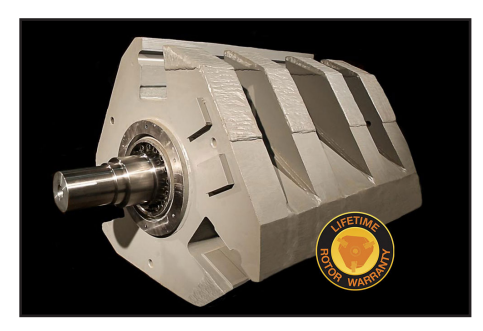
Solid-steel, three-bar, sculptured rotor with LIFETIME ROTOR WARRANTY, North America only.

CV refers to the discharge conveyor coming straight out from the front of the impactor plant.