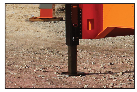
Hydraulic lift and leveling system enables quick set up and tear down.