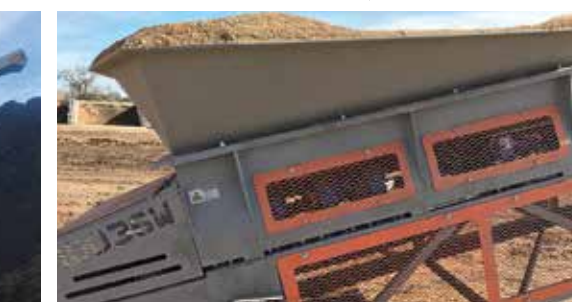
For a specific application that perfectly fits any need, custom conveyors and builds are available.