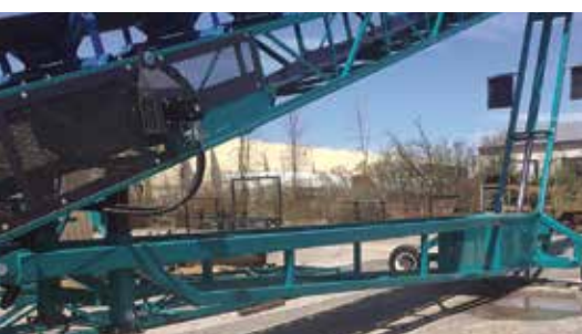
The hydraulic wrap drive provides maximum torque on the wheeled conveyors.