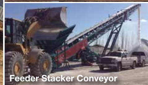
Feeder Stacker Conveyor