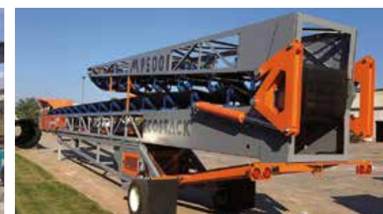
Easily transport any conveyor on the street with an optional road-legal package.