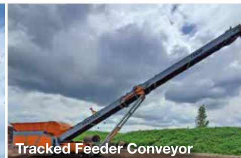
Tracked Feeder Conveyor