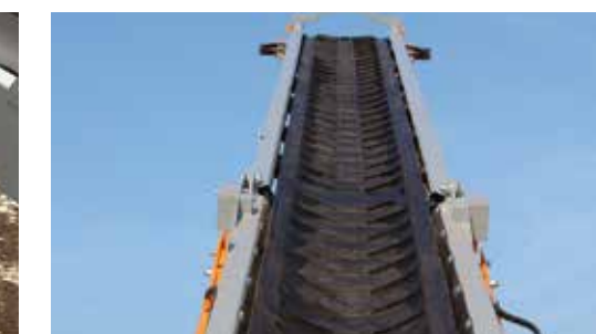
High-quality vulcanized belts deliver durable, long-lasting performance.