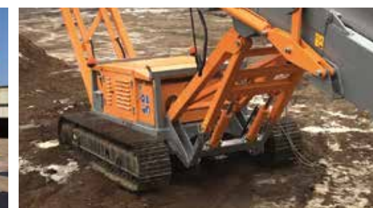
Heavy-duty tracks allow the conveyors to maneuver over rough and muddy terrain.