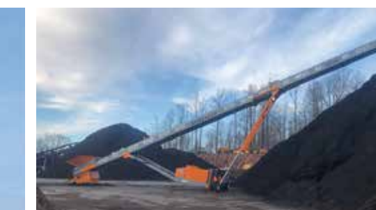
Satisfy any material handling need with models ranging in length from 50' to as long as 150'.