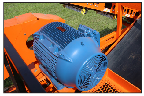
Includes all-electric motors and electrical cords.