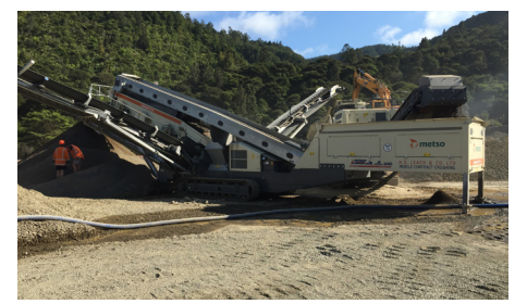
Multiple options for feeding.

*Capacity depends on application (required end products, feed material characteristics and size, moisture etc.).