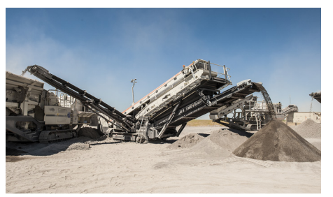
Interchangeable screen meshes.