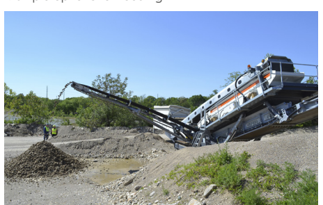
Easy access to the service locations.