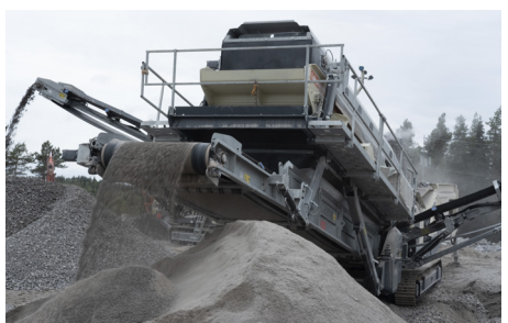
Safety by design.